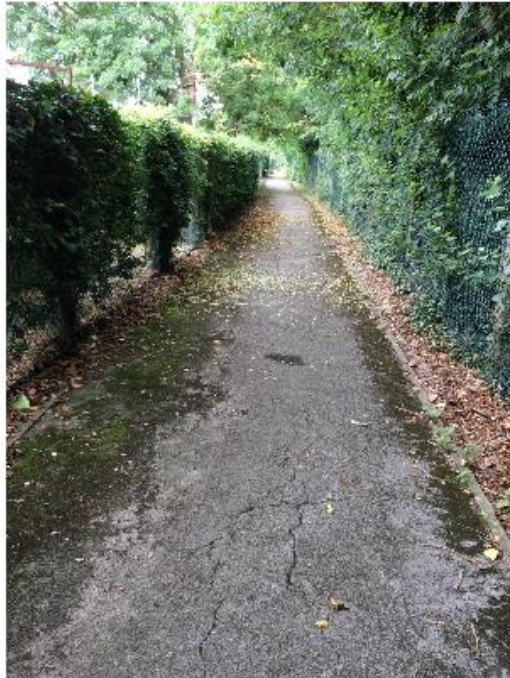
Current condition of the Tendring Road path